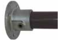
C11G40 Wall Flange

Allows ends of systems to be structurally fixed.