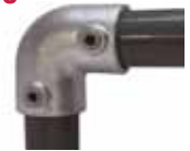
C02G40 90° Elbow

Used to change direction at 90° without bending the tube or to form D return end.