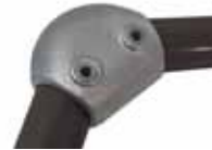
C05G40 Variable Elbow

Used to make joints at an angle of between 15° and 60° without bending the tube.